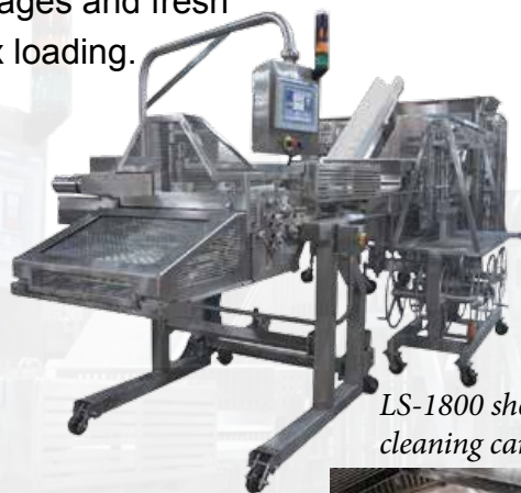
LS-1800 shown with cleaning cart option.